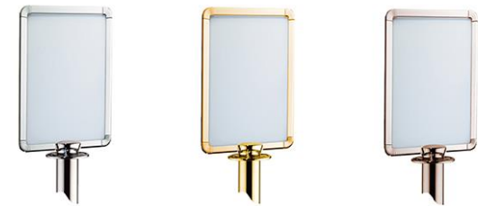
Option: Dikos display A4 or A3